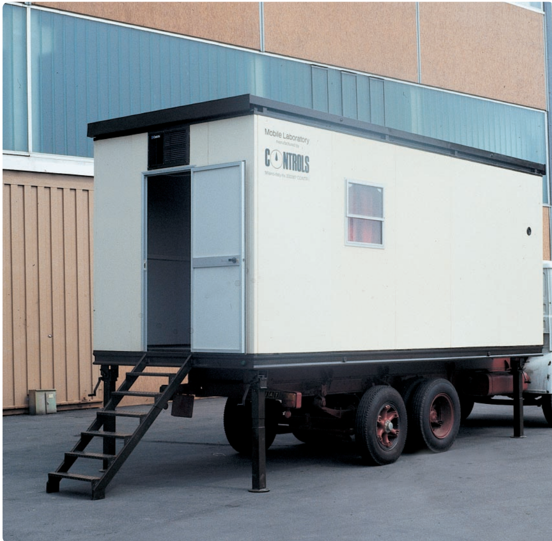
Concrete Container Laboratory Truck mounted.