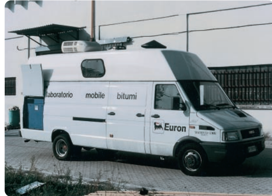
Bitumen Laboratory, van mounted, Complete with electric generator and air conditioner.

Once the tests are completed at one job-site, the laboratory can easily be moved to another one, without running the risk of damage or loss of the expensive testing equipment.