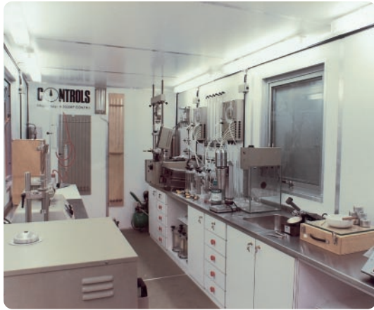
Internal view of a Soil Laboratory, container mounted.