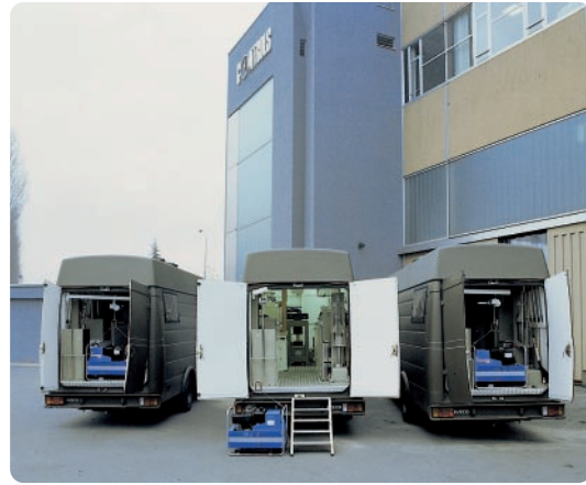
A fleet of three Road Laboratories van mounted