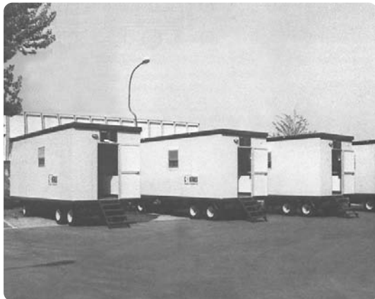
A fleet of five mobile Trailer Laboratories supplied to Dong Ah Construction Co. for the Great man-made River Project in Libya.

Controls can design the mobile laboratory conforming to your requirement. We give here some example of the mobile laboratory recently produced.