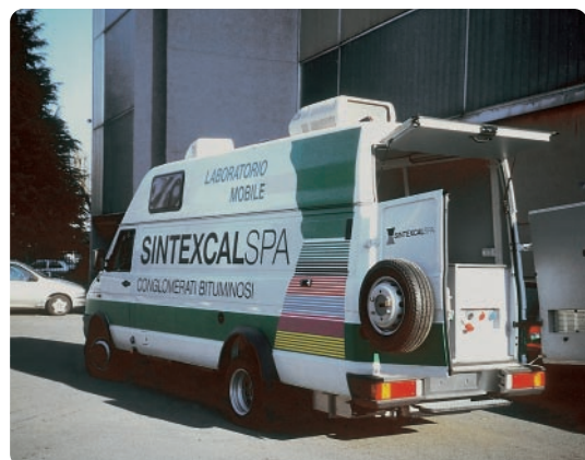
Asphalt Laboratory, van mounted, Complete with electric generator and air conditioner.